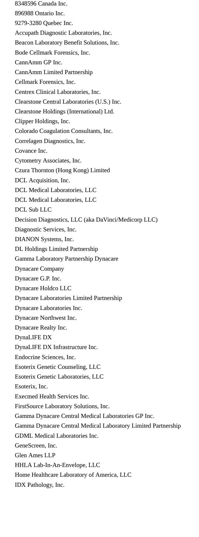
Exhibit 21 LIST OF SUBSIDIARIES

2089729 Ontario, Inc. 2248848 Ontario Inc.